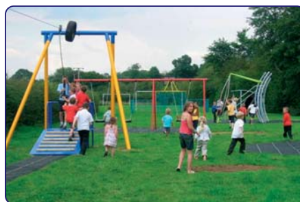
Refurbished play area