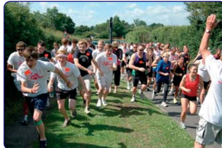
Village of discovery fun run